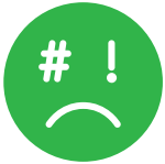
Self-Harm & Suicide